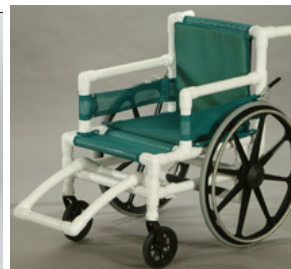
Aqua Chair $973.88