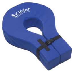
Neck Collar $51.95