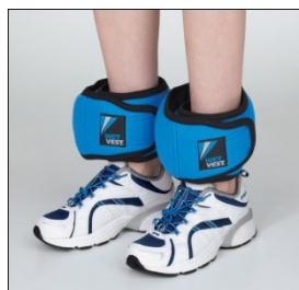
Wet Vest Float-Its II $26.95