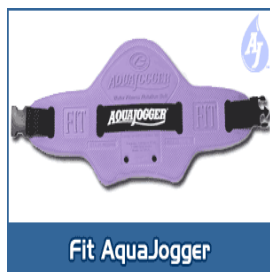
Flotation Belt $49.95

EQUIPMENT: The types of equipment available vary widely. Methods to enter the pool include ramps, mats, lifts, and aqua chairs. Once in the water if floatation assistance is needed this can be accomplished with vests, belts, rings, noodles, and suits. Water shoes, gloves, and cervical collars are all possible water attire to make swimming for exercise safer and more comfortable.